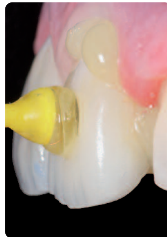
Cementation with Variolink Veneer (Dr S. Kina, Brazil / A. Bruguera, Spain)

In general, lithium disilicate (LS 2 ) is etched before it is placed. If a conventional cementation method is chosen, silanization is not required.