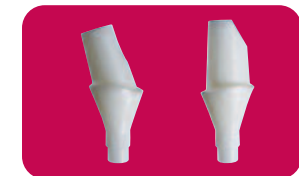
The abutment is exclusively available from Straumann.