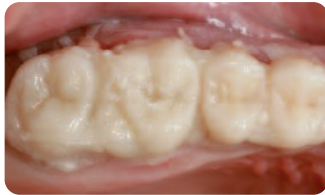
Cementation with Vivaglass CEM (Dr A. Kurbad / K. Reichel, Germany)

IPS e.max restorations are flexible with regard to their cementation requirements. Crowns and bridges can be cemented according to adhesive, self-adhesive and conventional methods. Inlays and veneers are cemented adhesively as usual.